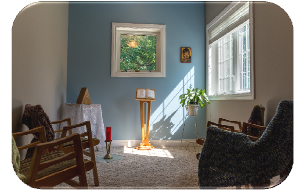
Quiet space for reflection, meditation or prayer