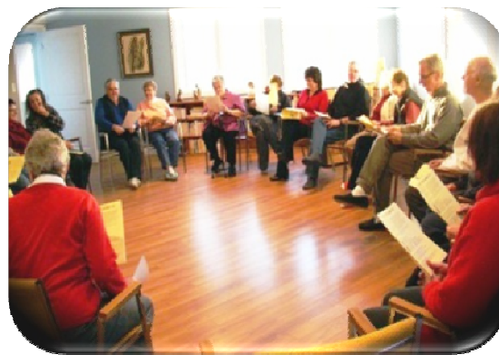
The Conference room can accommodate 25 to 30 people.

Light of the prairies Centre is the place for you.