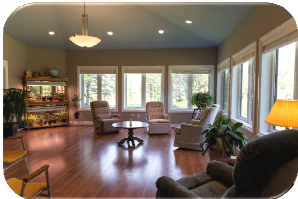
The Sunroom can accommodate 20 people