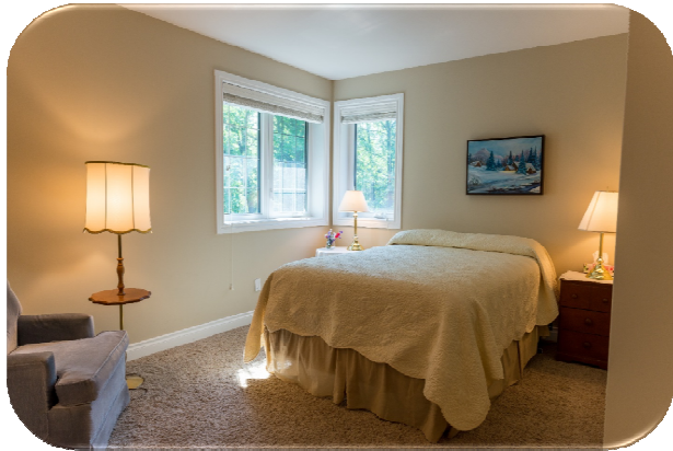
Affordable private rooms