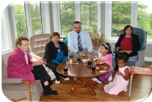
Where there is Love, there Light grows.

Based on the values of love, trust and goodness, Light of the Prairies Centre offers a safe and welcoming place to all who seek inner meaning, harmony and fullness of life.